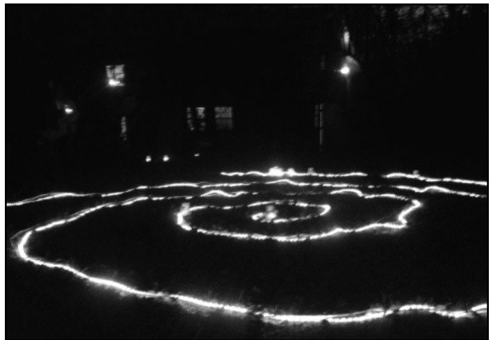
Ecology on Tap's Cosmic Walk ritual guided participants through the evolution of the universe.

This new series also held two rituals, a blessing of animals in October and the Cosmic Walk on November 5. One field trip also remains, this one to our eco-village and CSA on Saturday, November 12 th , 10:00 am to 12:00 noon.