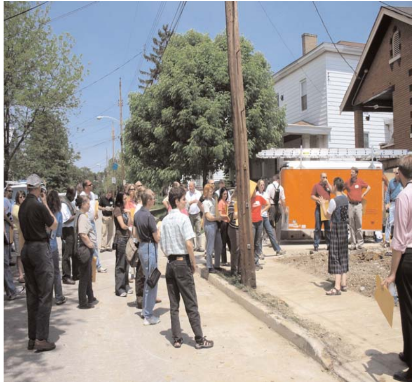
A GROUP FROM THE RAIN GARDEN ALLIANCE COMES TO THE ECOVILLAGE FOR A SITE VISIT.

As part of our grant requirements we will be having a workshop, so keep your eyes and ears peeled for news coming about that!